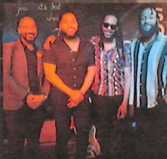
THE SMOOTH SHOW Band